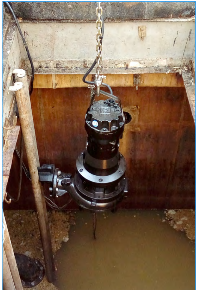
ZUG Uniqa Chopper