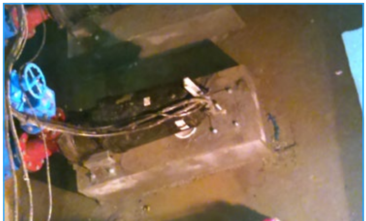
Installed dry well pumps in horizontal position